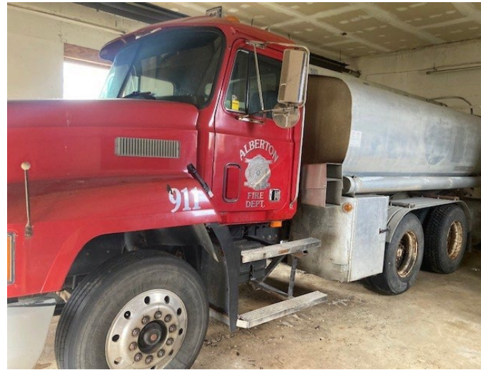
1992 Mack Columbia 120

Viewing will take place Friday, October 13, between 2 and 4 pm at Fire# 50, Church Rd. (Directly across from the Township office) Bid forms and additional information can be found online at www.alberton.ca .