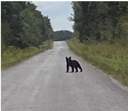
Black Bear spotted on Ducharme Road.

The Township office will be CLOSED Monday September 4th for Labour Day.